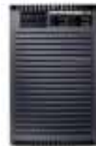
HP Integrity rx8640 Server