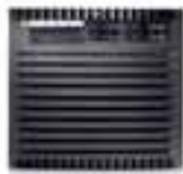
HP Integrity rx7640 Server